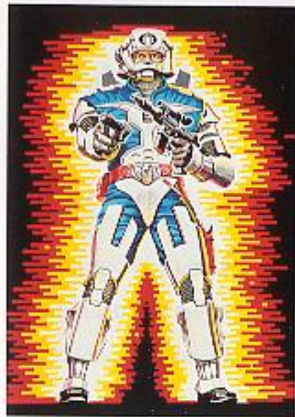
Level 6-1: Cobra Commander™